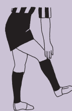
ILLEGAL BALL OFF BODY