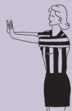
PUSHING OR BODY CONTACT